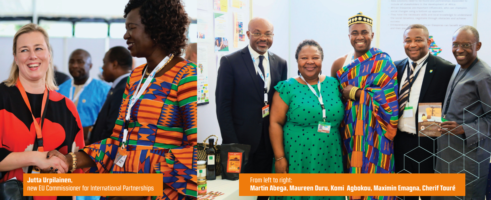
Jutta Urpilainen, new EU Commissioner for International Partnerships