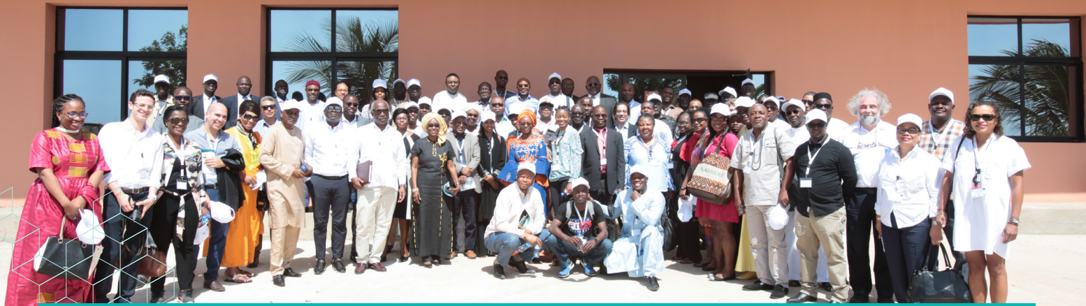
Parc Industriel Intégré de Diamniadio (P2ID) - This platform was inaugurated by the President of the Republic in 2018. The site covers 13 ha. Set up as a Special Economic Zone, the platform will potentially accommodate more than 23,000 jobs by 2023. Today, it counts around 1,000 employees of industrial companies or service companies