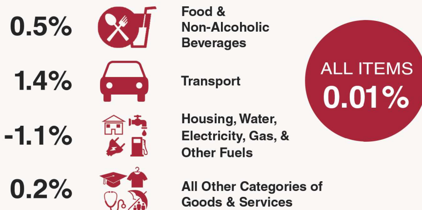
Figure 2: Inflation Rates by Major Categories; November 2019