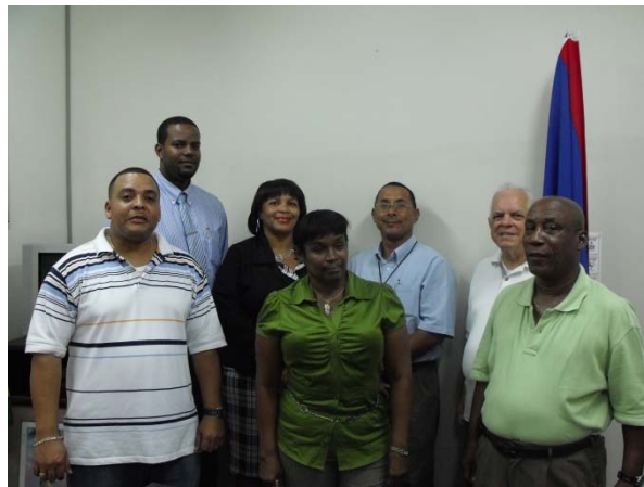
Board of Directors – Custom Brokers Association of Belize

Association or Group of Companies Membership have the ability to choose from any level of entry, beginning at the levels: Signature, the Distinguished, and the President's Circle and to be recognized and receive benefits according to the membership type level it has chosen. The value of the Association or Group of Companies Membership package is doubled that of the respective membership level. (eg. Association/Group of Companies Membership with Distinguished status is $1000.00 x 2 = $2000.00 BZD)